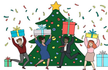
Thanks from the staff!